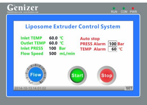
Sanitary High Pressure pump control system